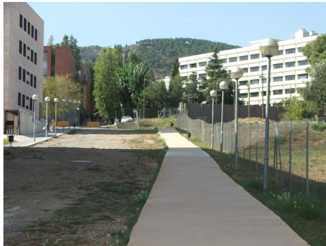
The Executive Board Meeting will take place in the second row of the brick buildings. To get to the General Meeting, turn R at the end of this path.

Continue up the path on the right of this building in order to arrive to a row of identical brick buildings. The second row will include B6 (the location of the Executive Board Meeting – Oct 18, Tue, 08 30 am). If you turn right into a gate at the top of this path, you will arrive at Vertex (the location of the General Meeting – Oct 18, Tue, 10 15 am). (Alternatively, you can follow the path next to the last row of brick buildings at the very top and then turn right and walk 50 meters downhill)