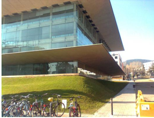
This is the BSC headquarters. Follow the path on the right hand side.

Continue up the path on the right of this building in order to arrive to a row of identical brick buildings. The second row will include B6 (the location of the Executive Board Meeting – Oct 18, Tue, 08 30 am). If you turn right into a gate at the top of this path, you will arrive at Vertex (the location of the General Meeting – Oct 18, Tue, 10 15 am). (Alternatively, you can follow the path next to the last row of brick buildings at the very top and then turn right and walk 50 meters downhill)